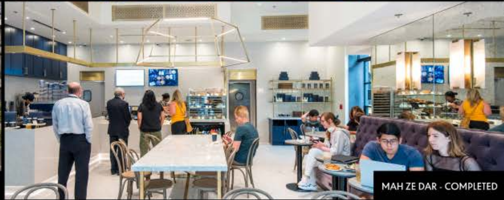
MAH ZE DAR - COMPLETED