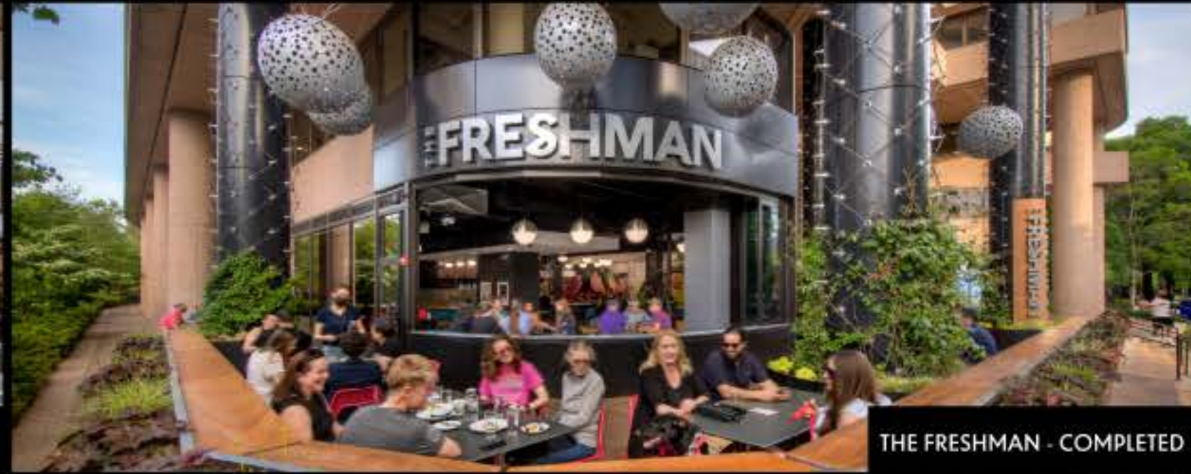
THE FRESHMAN - COMPLETED