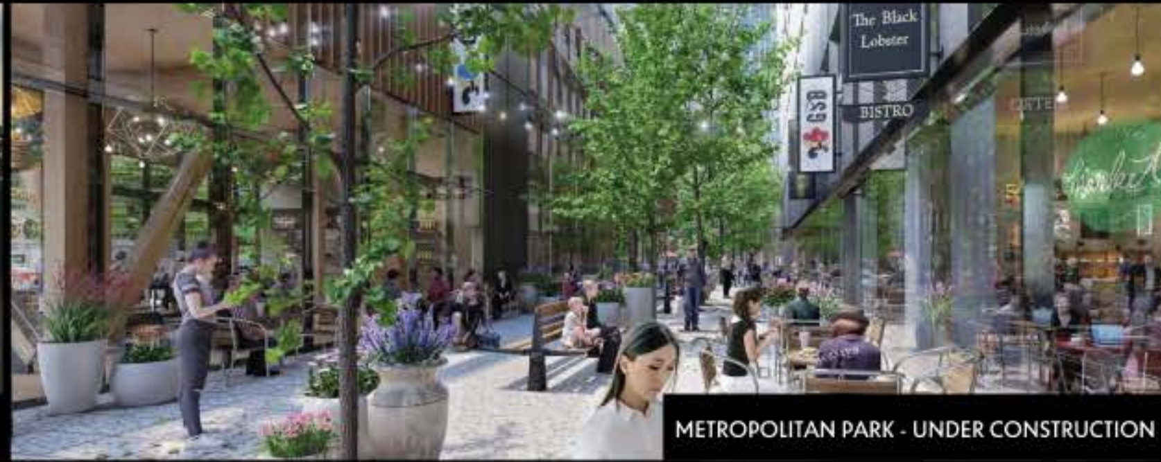
METROPOLITAN PARK - UNDER CONSTRUCTION