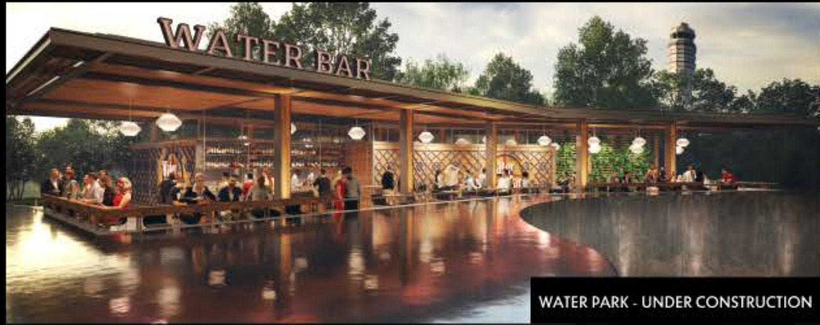
WATER PARK - UNDER CONSTRUCTION

Sampling of new retailers in National Landing.