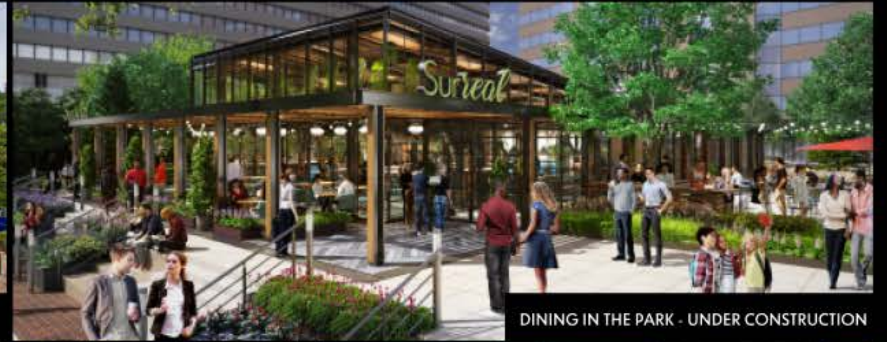
DINING IN THE PARK - UNDER CONSTRUCTION