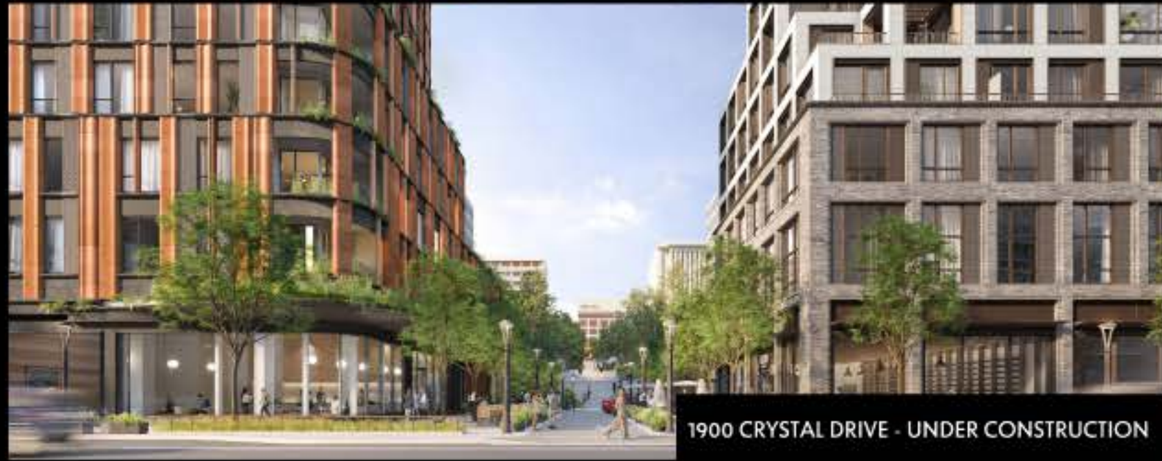
1900 CRYSTAL DRIVE - UNDER CONSTRUCTION