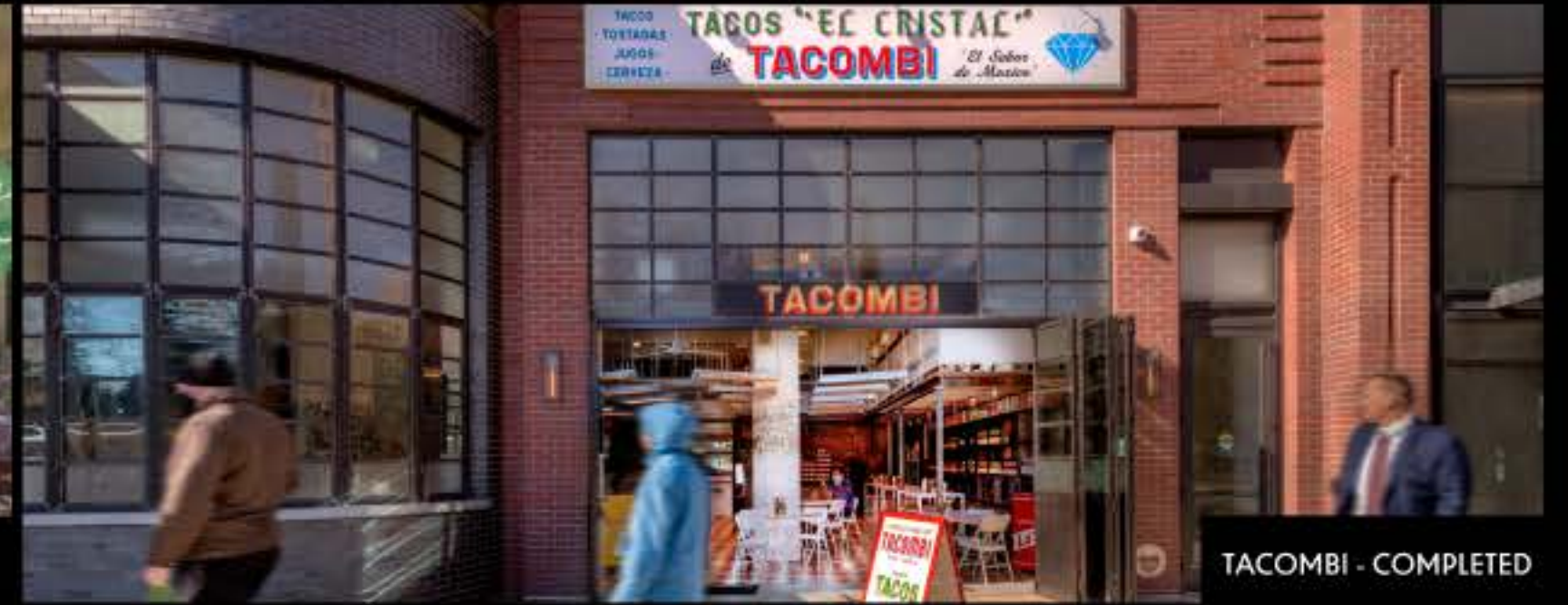
TACOMBI - COMPLETED