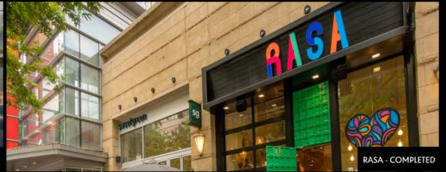
RASA - COMPLETED