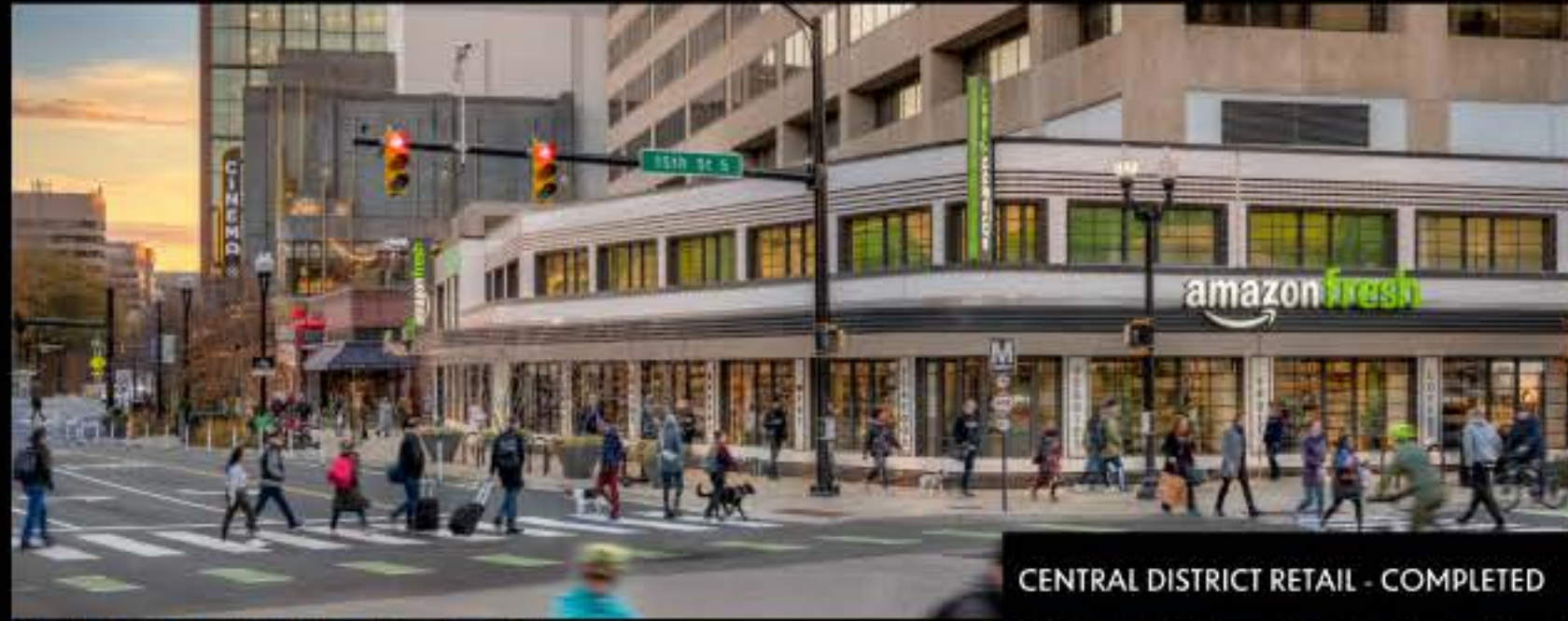
CENTRAL DISTRICT RETAIL - COMPLETED