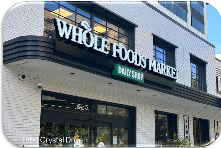
1550 Crystal Drive