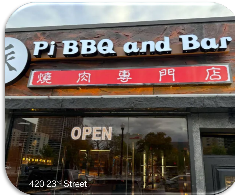
420 23rd Street