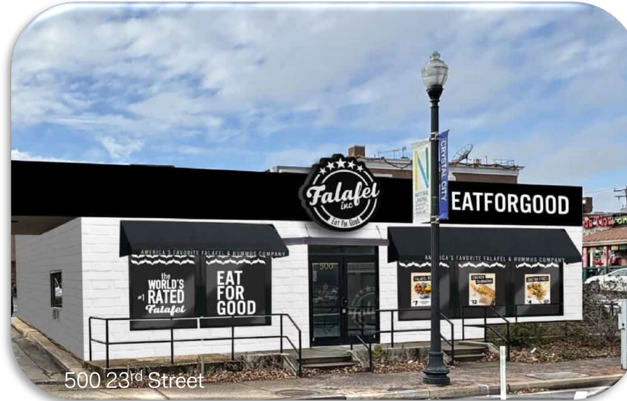
500 23rd Street