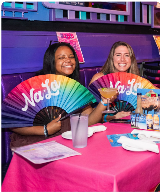
COMMUNITY & CULTURE