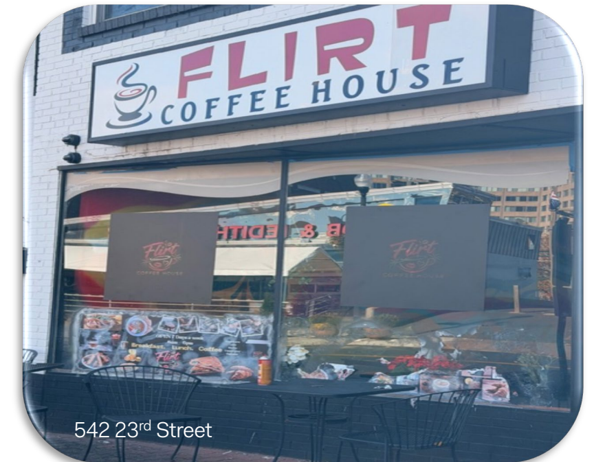
542 23rd Street